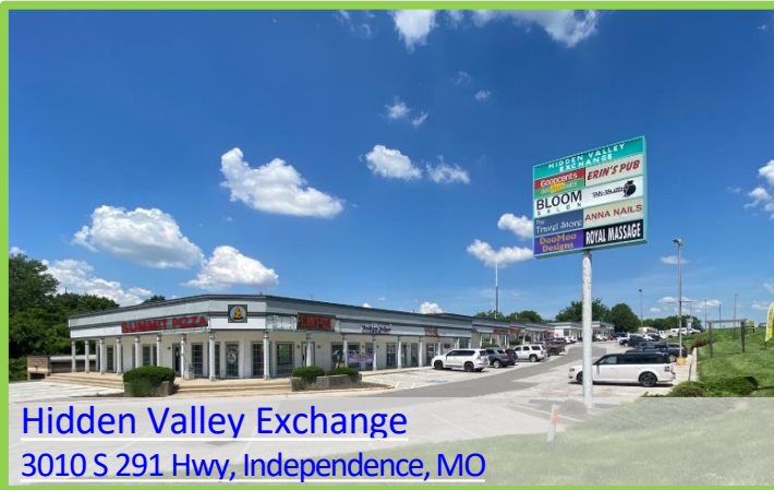
Hidden Valley Exchange 3010 S 291 Hwy, Independence, MO