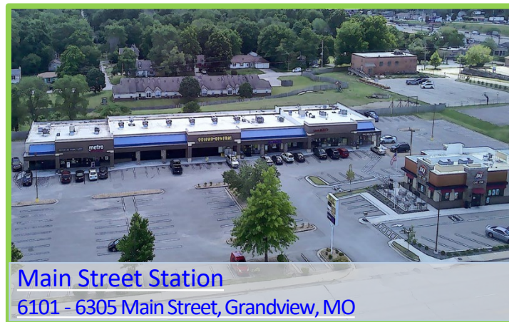
Main Street Station 6101 - 6305 Main Street, Grandview, MO