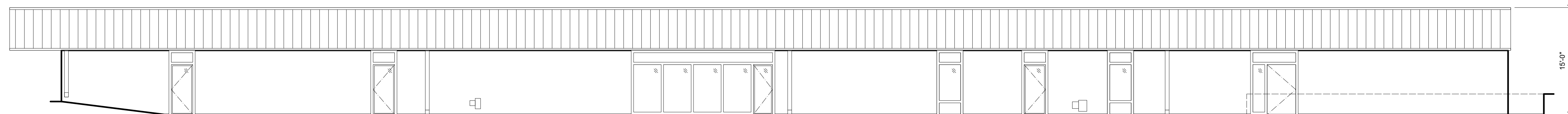
2 OVERALL EAST ELEVATION SCALE: 1/8" = 1'-0"

ISSUE DATE DESCRIPTION 01/29/26 PERMIT SET