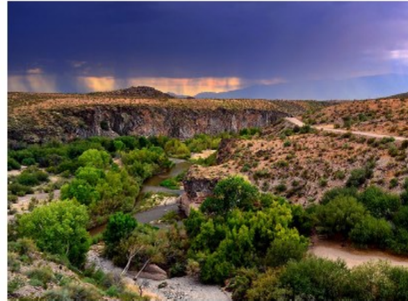
Town Squares - Safford, AZ