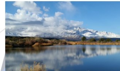
Roper Lake State Park

From hot springs to sand dunes to rock fields, Safford brings together many features that make Arizona famous in one place. Winter visitors are attracted to the climate and variety of natural resources, including hiking, swimming, fishing, hunting, bird watching, and much more.