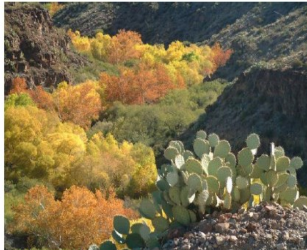
Gila Box Riparian National Conservation Area