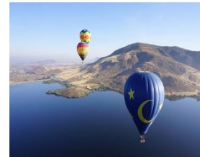
Black Hills Rockhound Area