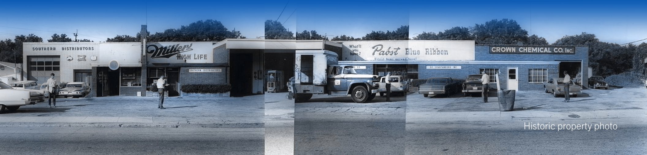
Historic property photo

ANTHONY PORCHETTA aporchetta@trinity-partners.com 908.787.4635