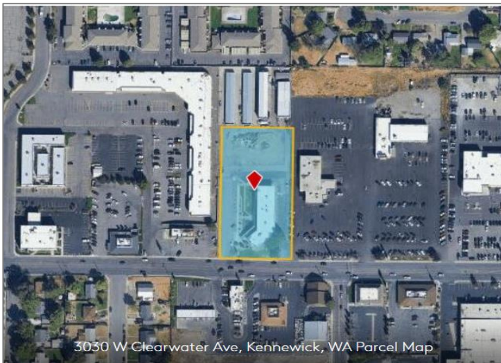
3030 W Clearwater Ave, Kennewick, WA Parcel Map