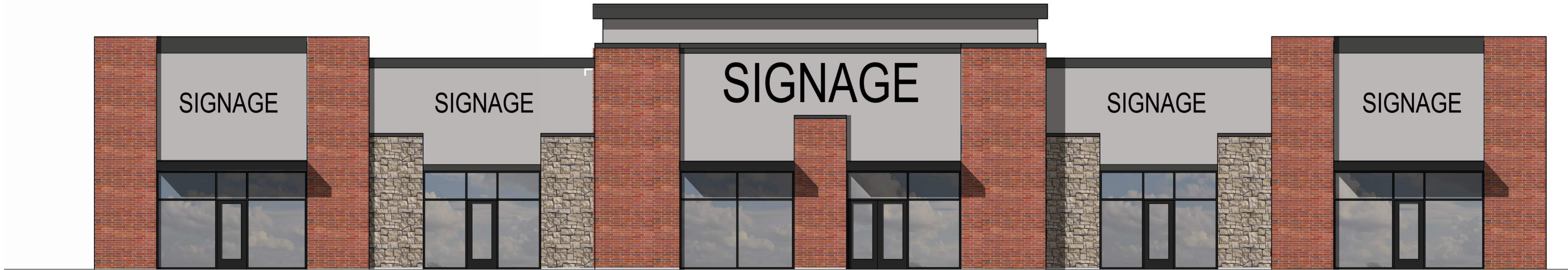
NORTH ELEVATION ④ SCALE: 3/16" = 1'-0"