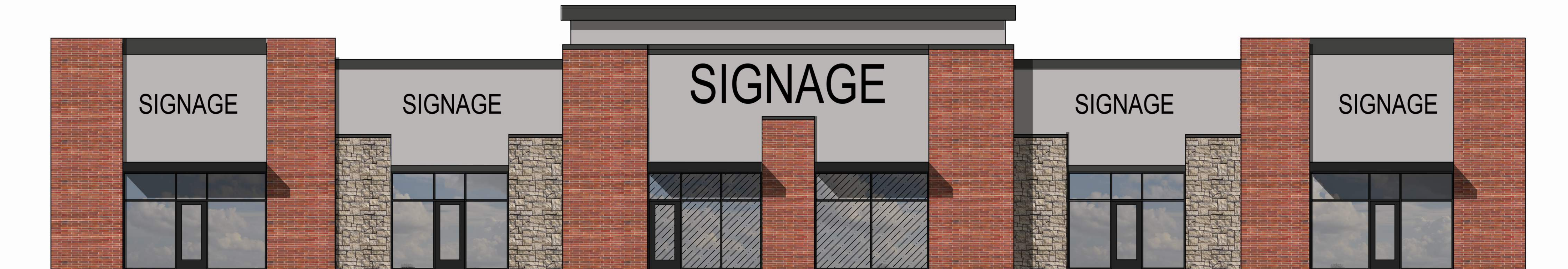
SOUTH ELEVATION ① SCALE: 3/16" = 1'-0"

SHELL BUILDING MULTI TENANT LOT 21 8585 W 135TH ST OVERLAND PARK, KS