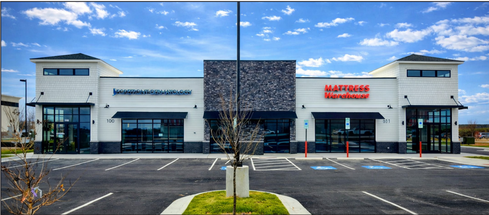
New Retail Development at Tanglewood | 3825 Conlon Way, Elizabeth City, NC