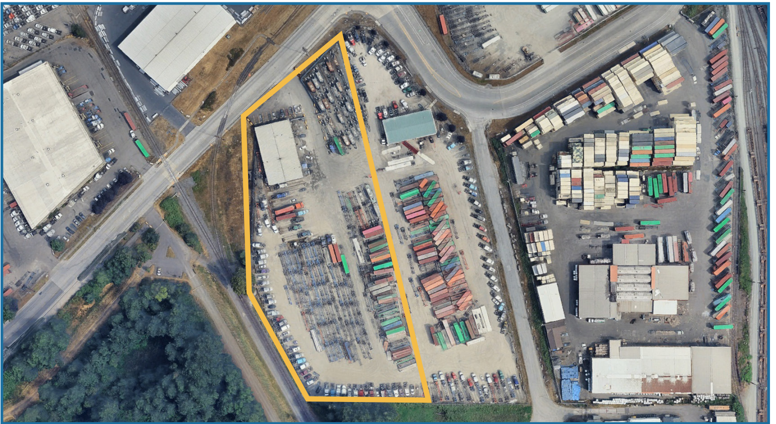
4 Acres - 1614 Lincoln Ave