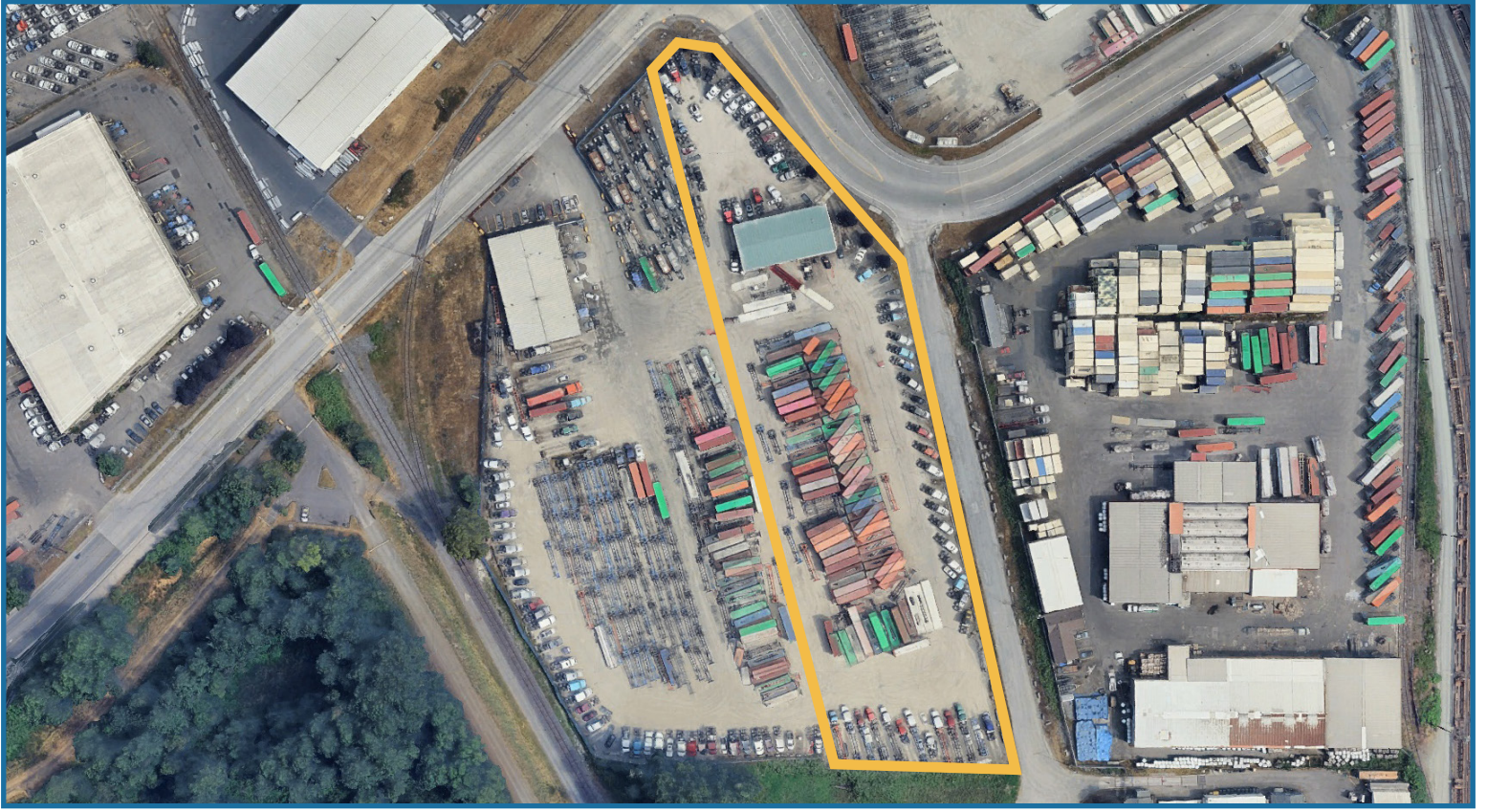
3.07 Acres - 1620 Lincoln Ave

7.07 Acre Site - 3.07 Acres Available September 1, 2026