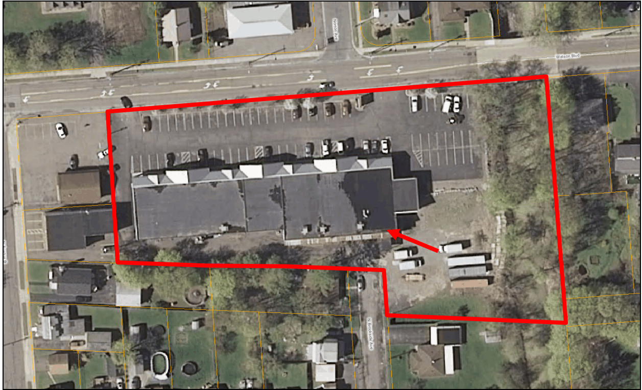
Figure 2 – Aerial photograph of the site