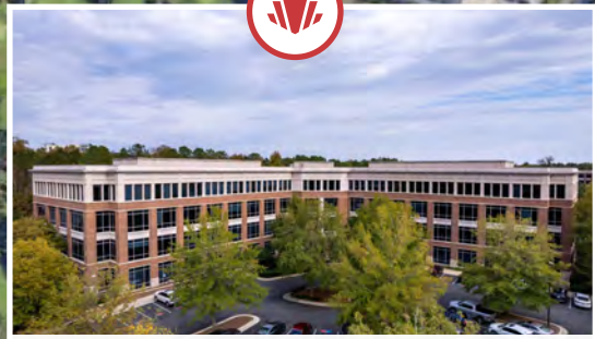
THE EXCHANGE WEST