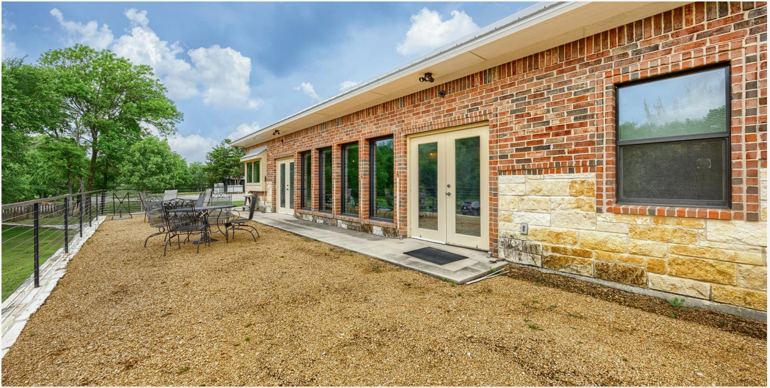
Rear Entry & Patio