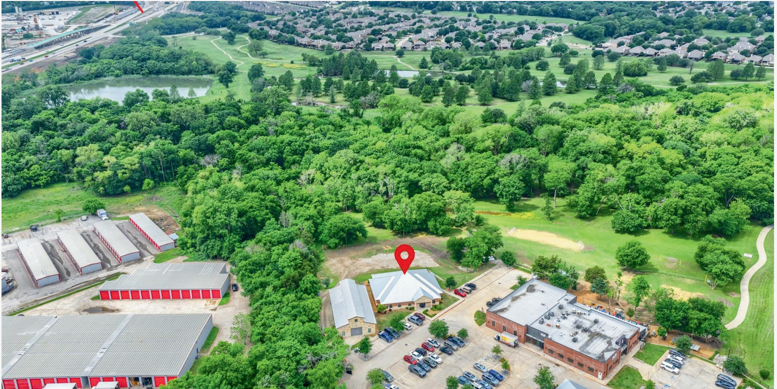
Ample greenspace currently behind building

This information has been obtained from sources believed reliable, but has not been verified for accuracy or completeness. You should conduct a careful, independent investigation of the property and verify all information.