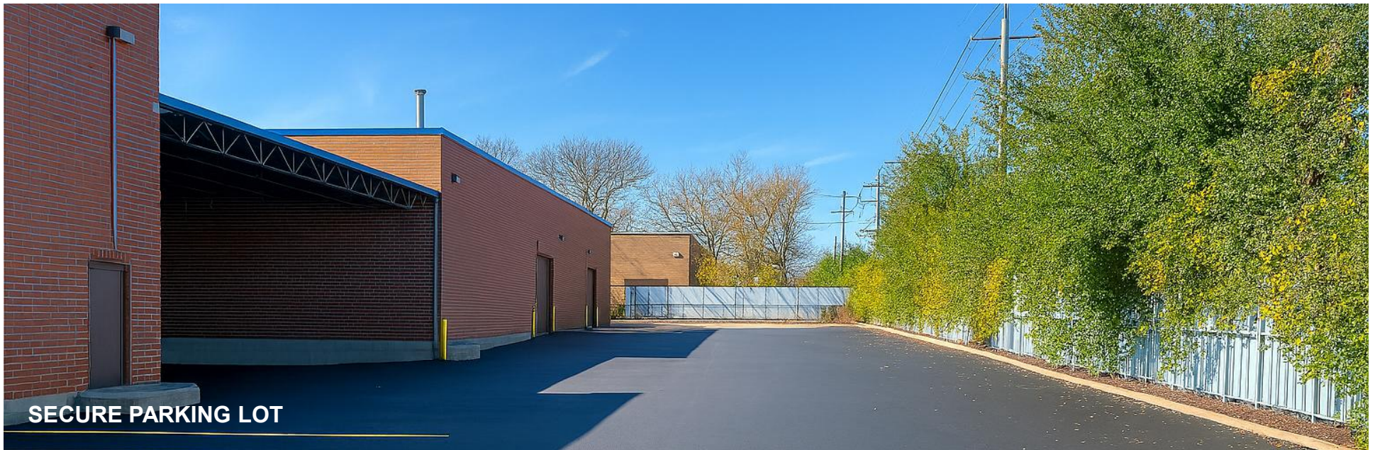
SECURE PARKING LOT