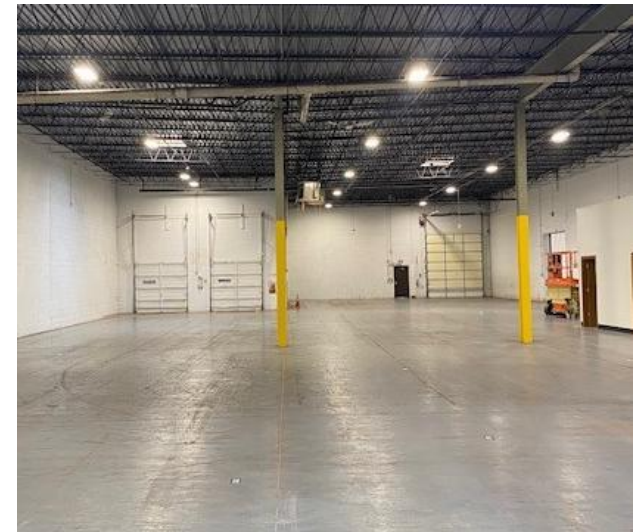
WAREHOUSE & OFFICE AREAS