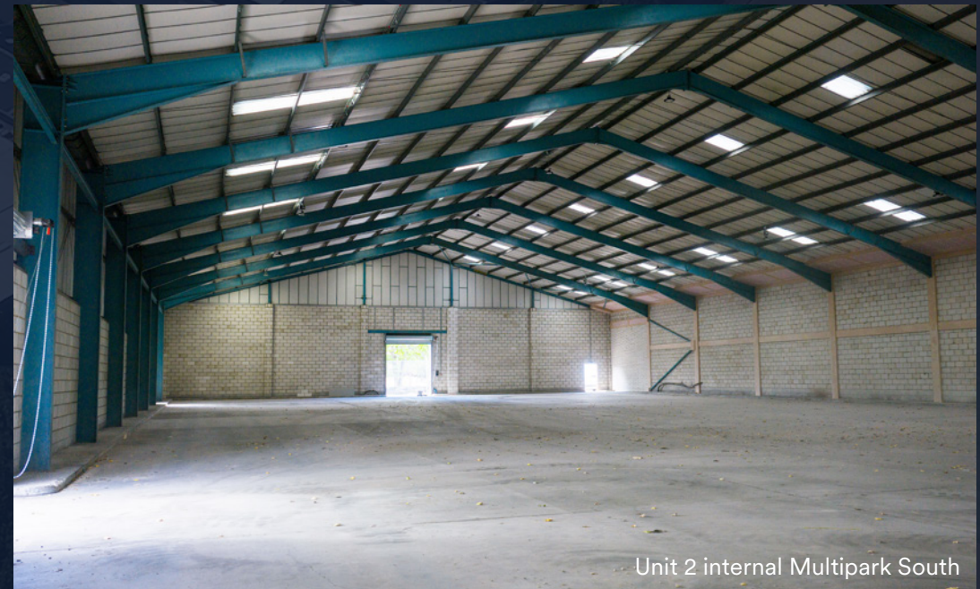
Unit 2 internal Multipark South