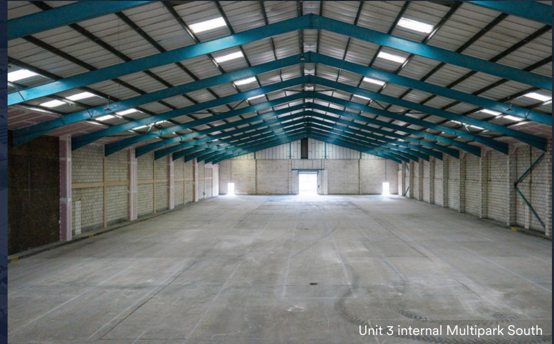
Unit 3 internal Multipark South

Plots of 1 - 5 acres of concreted secure yard space are available by separate negotiation.