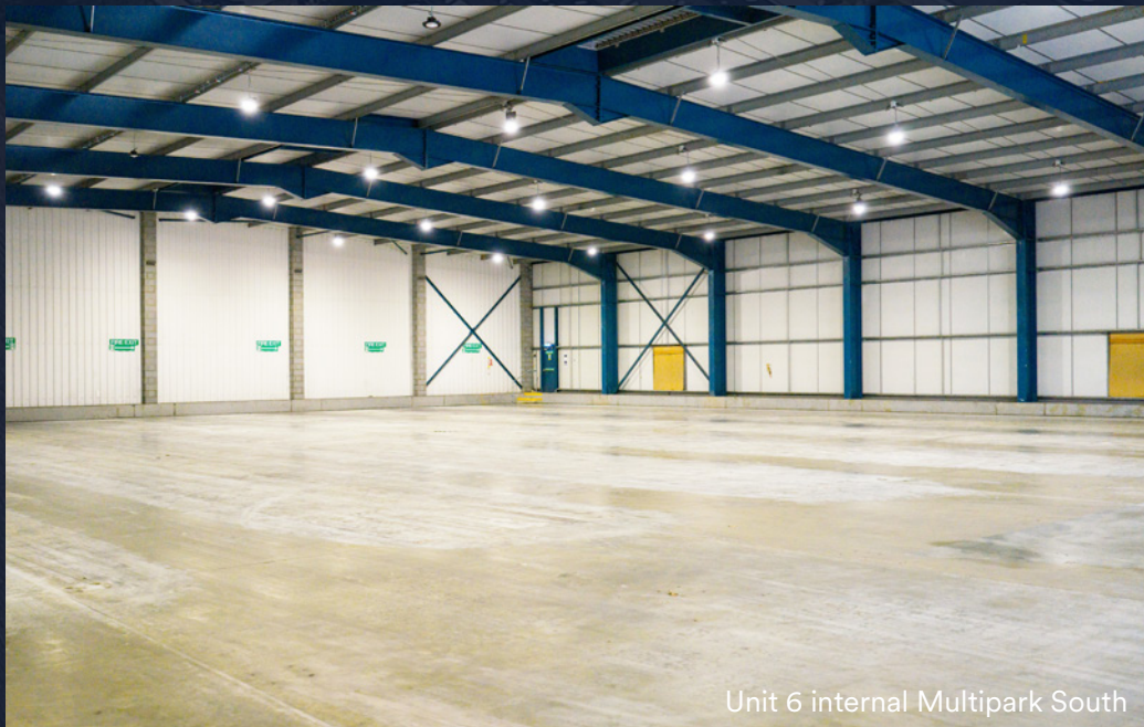
Unit 6 internal Multipark South