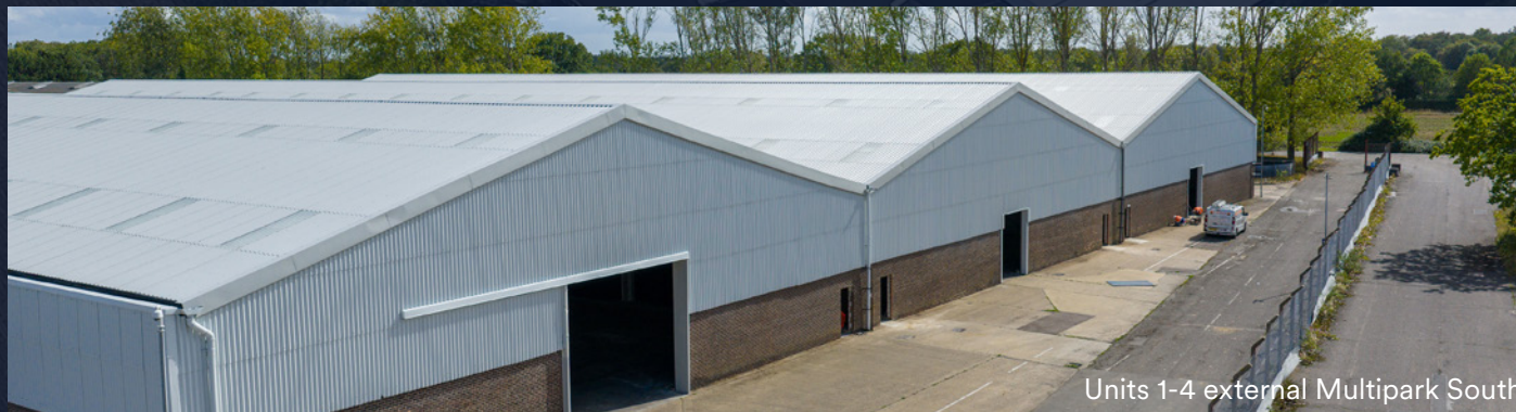
Units 1-4 external Multipark South