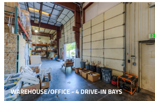
WAREHOUSE/OFFICE - 4 DRIVE-IN BAYS