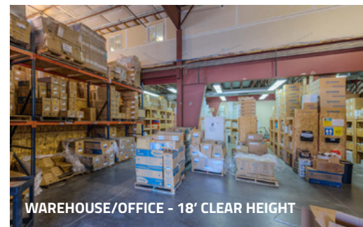
WAREHOUSE/OFFICE - 18' CLEAR HEIGHT

Disclosure: Listing Broker(s) has an ownership interest in subject Property and represents the Seller/Landlord as its Agent. All information furnished regarding this property is obtained from sources deemed reliable. Dean Callan & Company, Inc. makes no representation, guarantee or warranty, expressed or implied, as to the accuracy thereof.