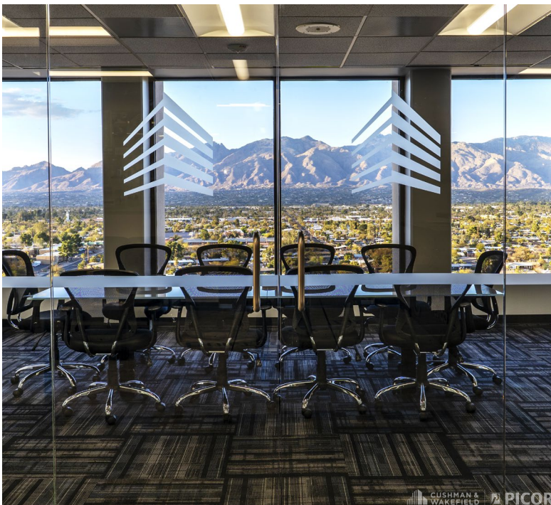
BFL Conference Room