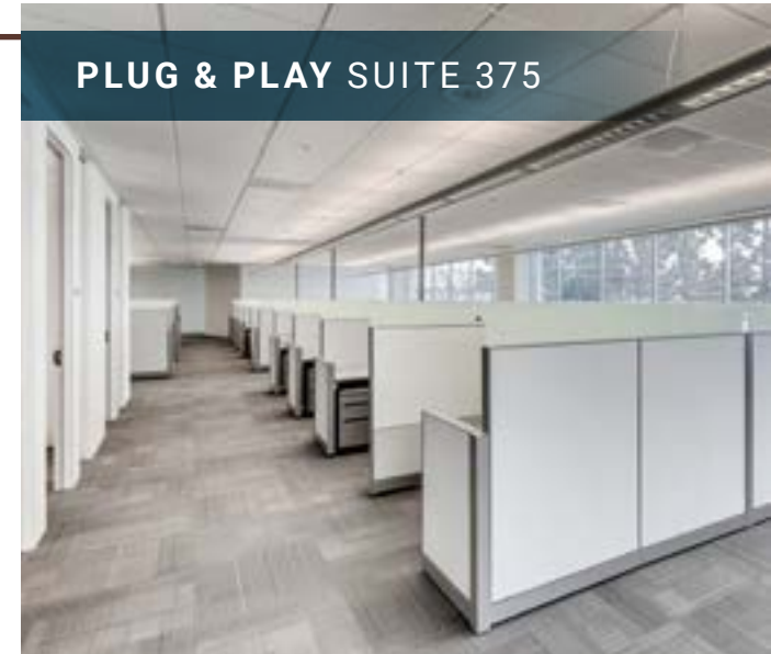
PLUG & PLAY SUITE 375

Floorplates that provide efficient, productive work spaces suitable for numerous layouts and configurations.