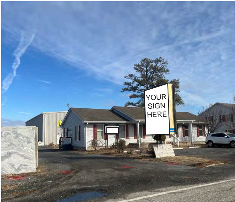
2,000 SF Office With Apartment