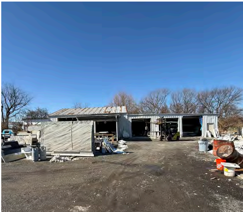
5-Bay Single Story