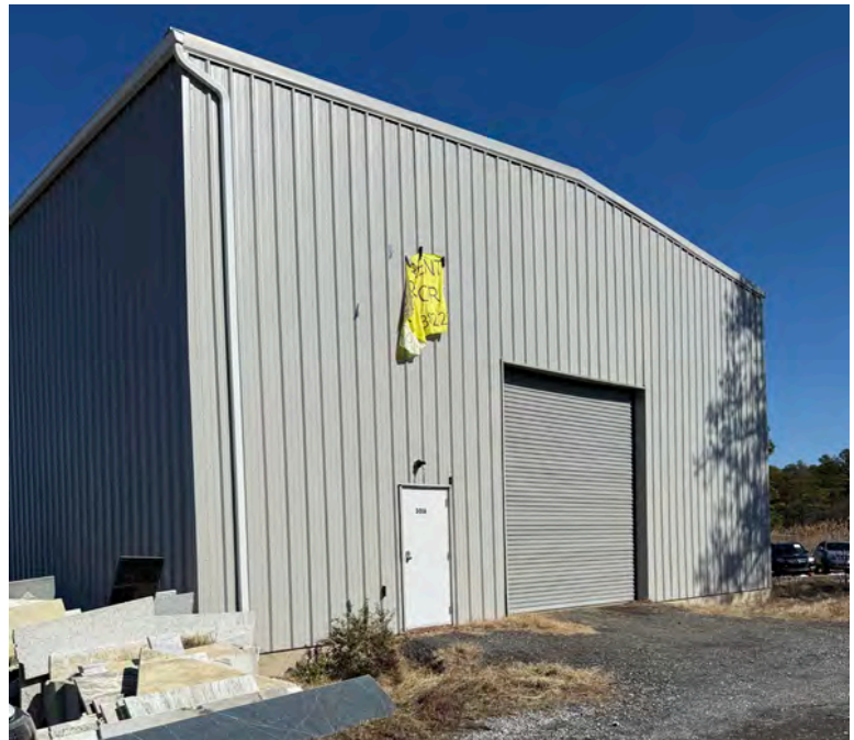
5,000 SF Warehouse - 20' Clear