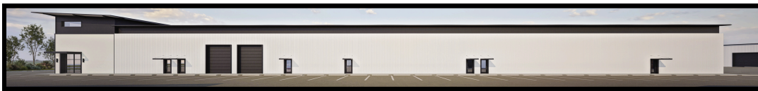
Building A- (West Elevation) Phase 1 Anticipated Occupancy: Nov. 2026

PRE-LEASING OFFICE-WAREHOUSE, FLEX SPACE Suites starting at 2,100 SF+ Base Rents: $16.00 - $22.00 per SF/YR Plus estimated NNN expenses of $3.00 per SF/YR