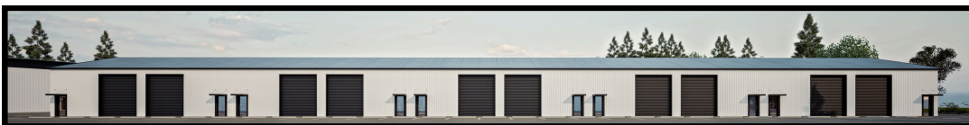
Building E Phase 3