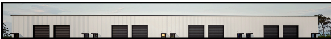
Building C Phase 1 Anticipated Occupancy: Dec. 2026