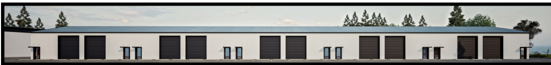
Building D Phase 2