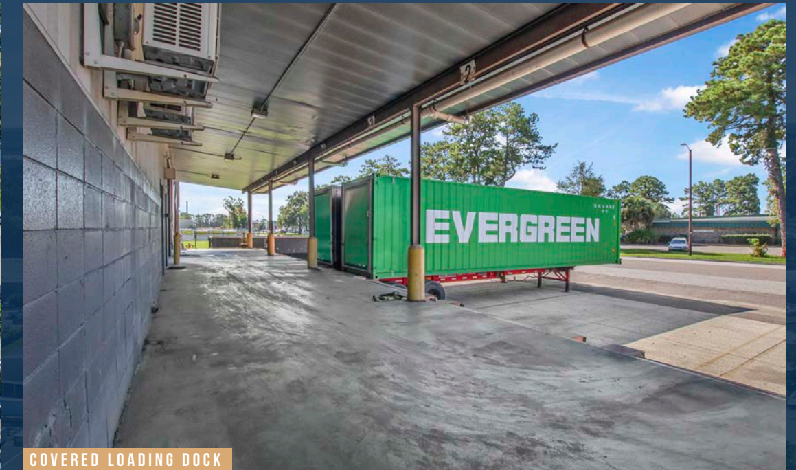
COVERED LOADING DOCK