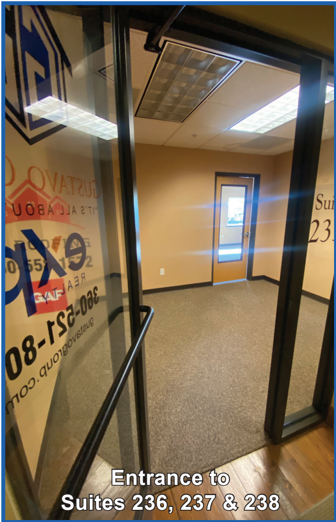
Entrance to Suites 236, 237 & 238