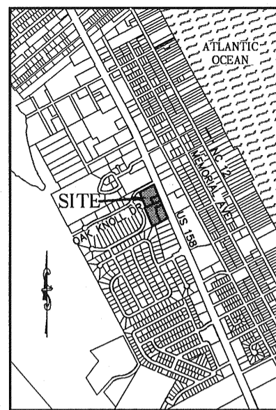
VICINITY MAP (MS)