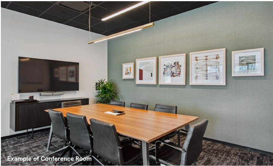
Example of Conference Room