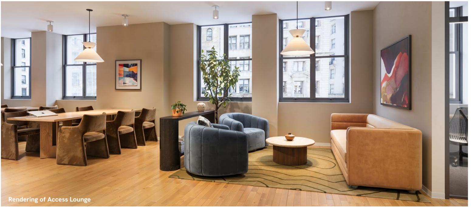
Rendering of Access Lounge