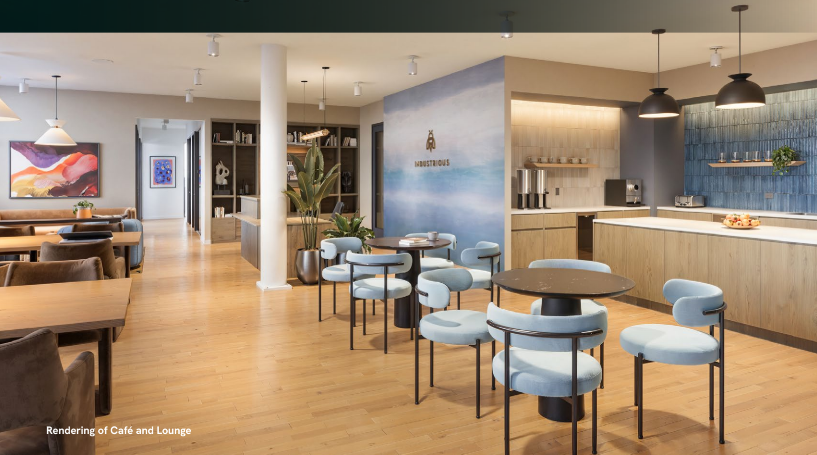
Rendering of Café and Lounge