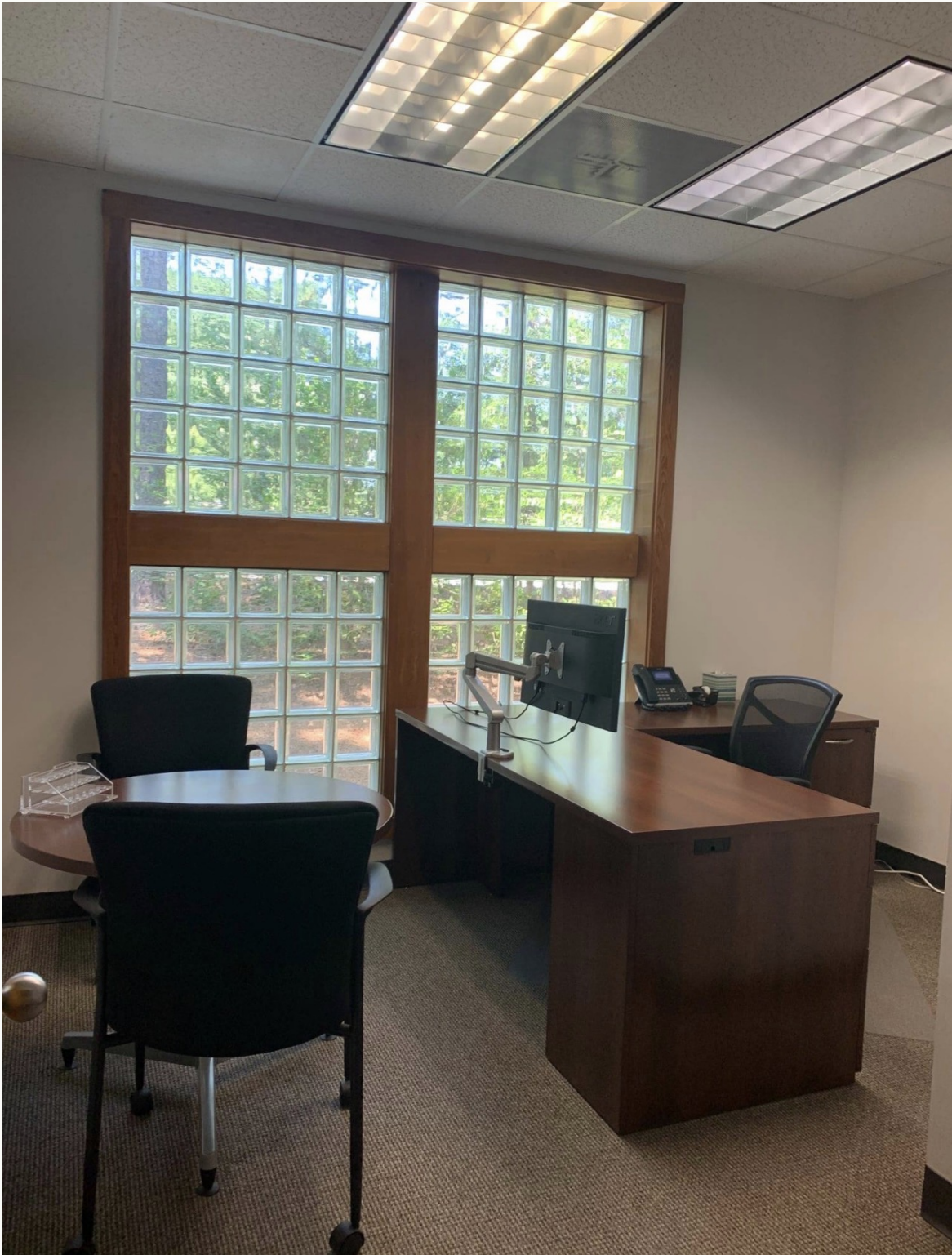
A representative private office — glass-block window wall delivers abundant daylight.