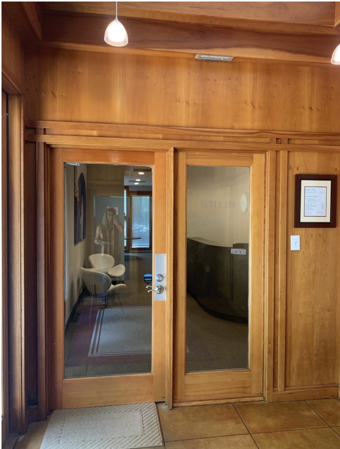
Entry to Suite 150, off the main building lobby.