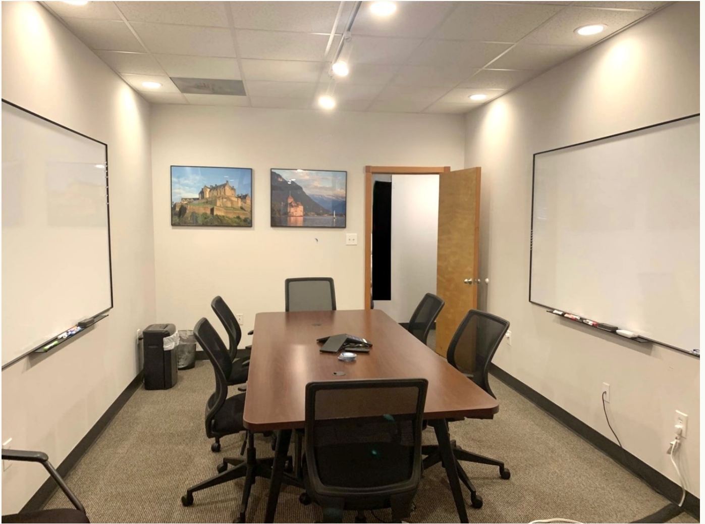
Spacious conference room with dual whiteboards — seats eight comfortably.