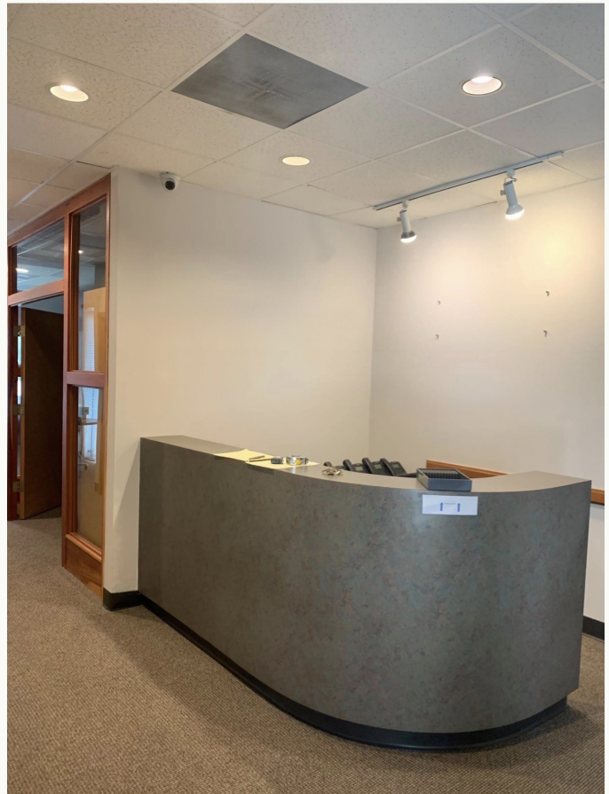
Built-in reception desk and waiting area.