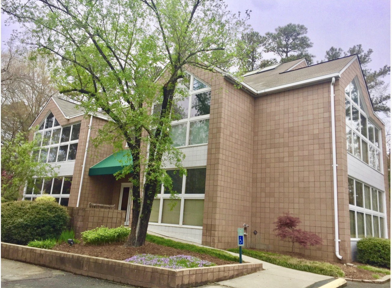
976 MLK, Jr. Blvd., Chapel Hill, NC · In-town, next to the YMCA near Estes Drive

2,030 SF · 5–7 Private Offices · $3,650/month · Available Early July