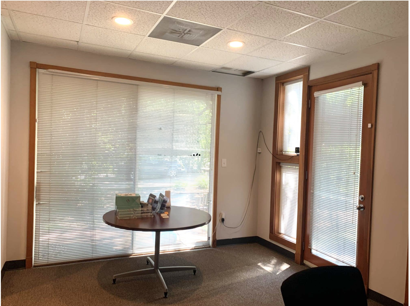
One of the meeting / breakout areas with direct access to a private covered deck.