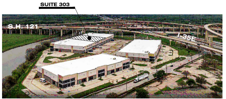
4 VICINITY MAP SCALE: NTS