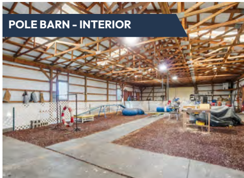
POLE BARN - INTERIOR