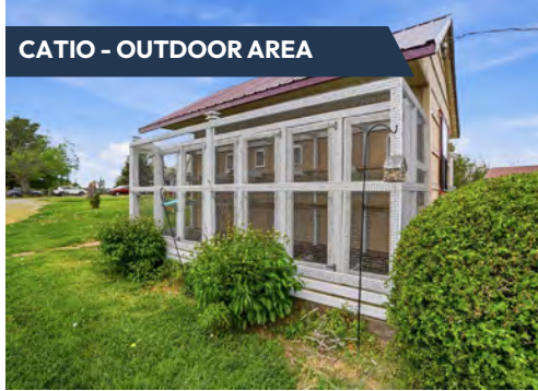
CATIO - OUTDOOR AREA