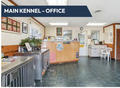
MAIN KENNEL - OFFICE