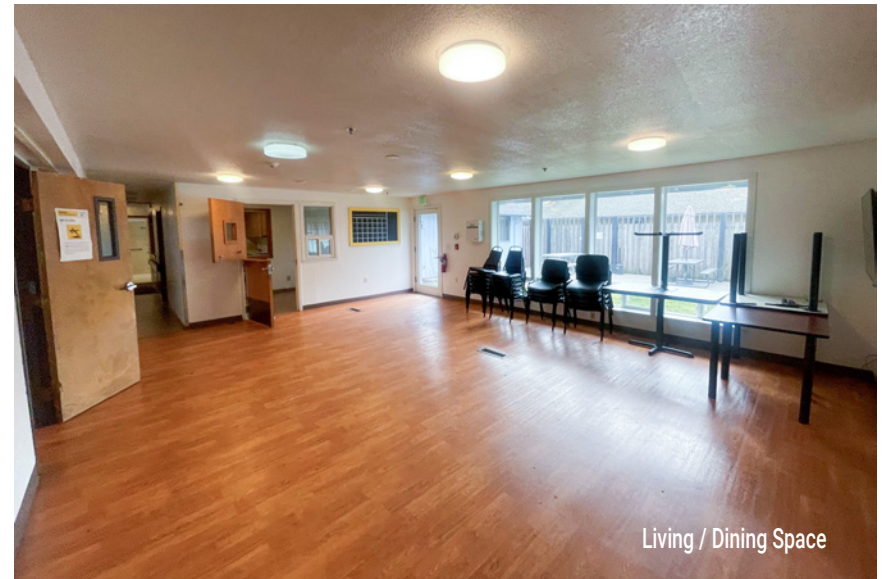
Living / Dining Space