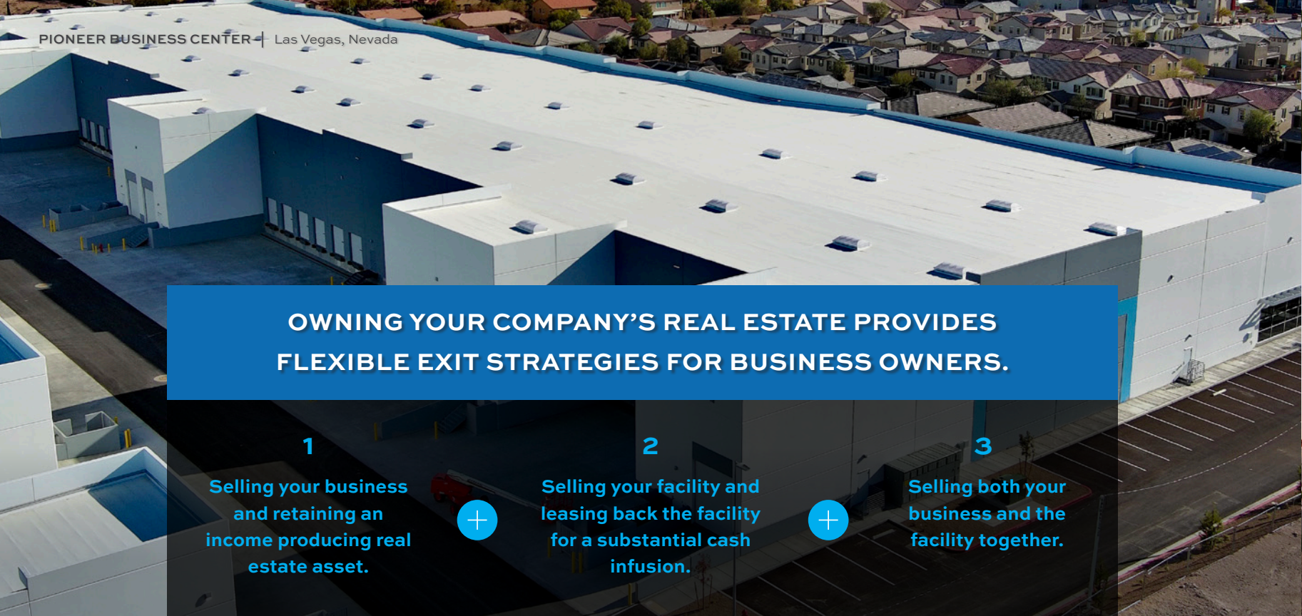
PIONEER BUSINESS CENTER | Las Vegas, Nevada