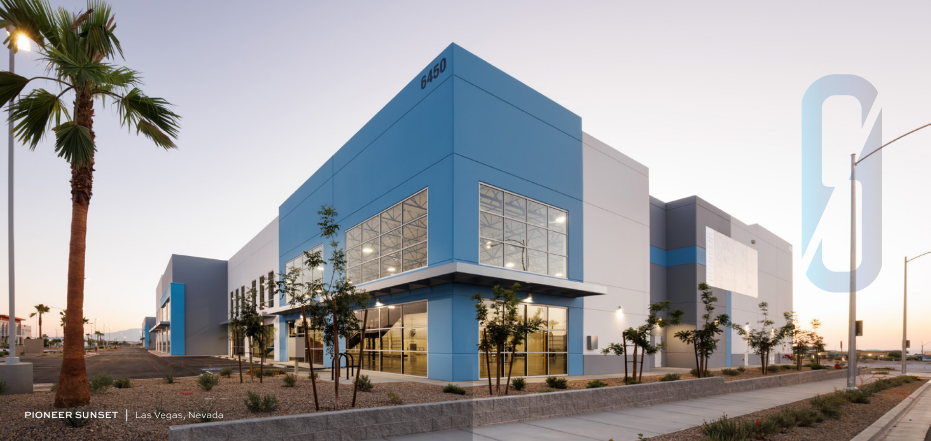
PIONEER SUNSET | Las Vegas, Nevada