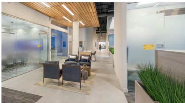
Above: Flex/R&D interior office build-out Below: Flex/R&D Warehouse/lab build-out