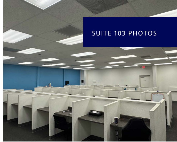
SUITE 103 PHOTOS