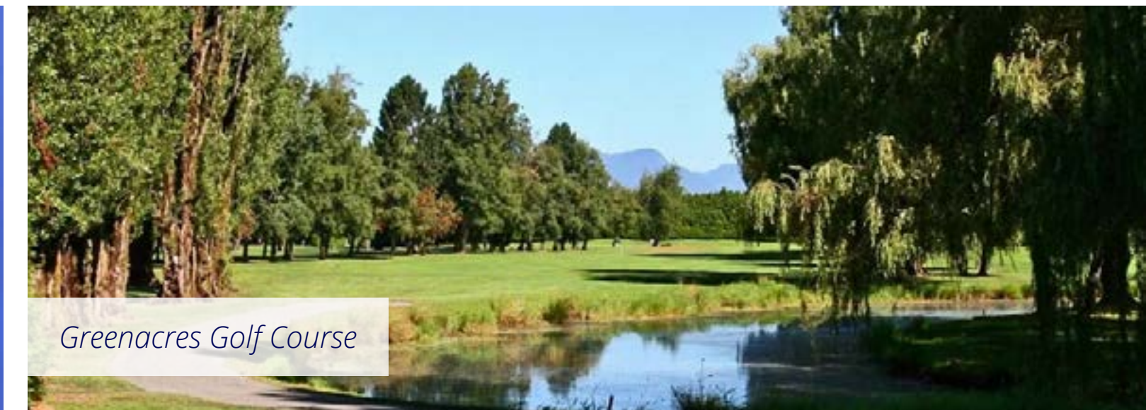
Greenacres Golf Course