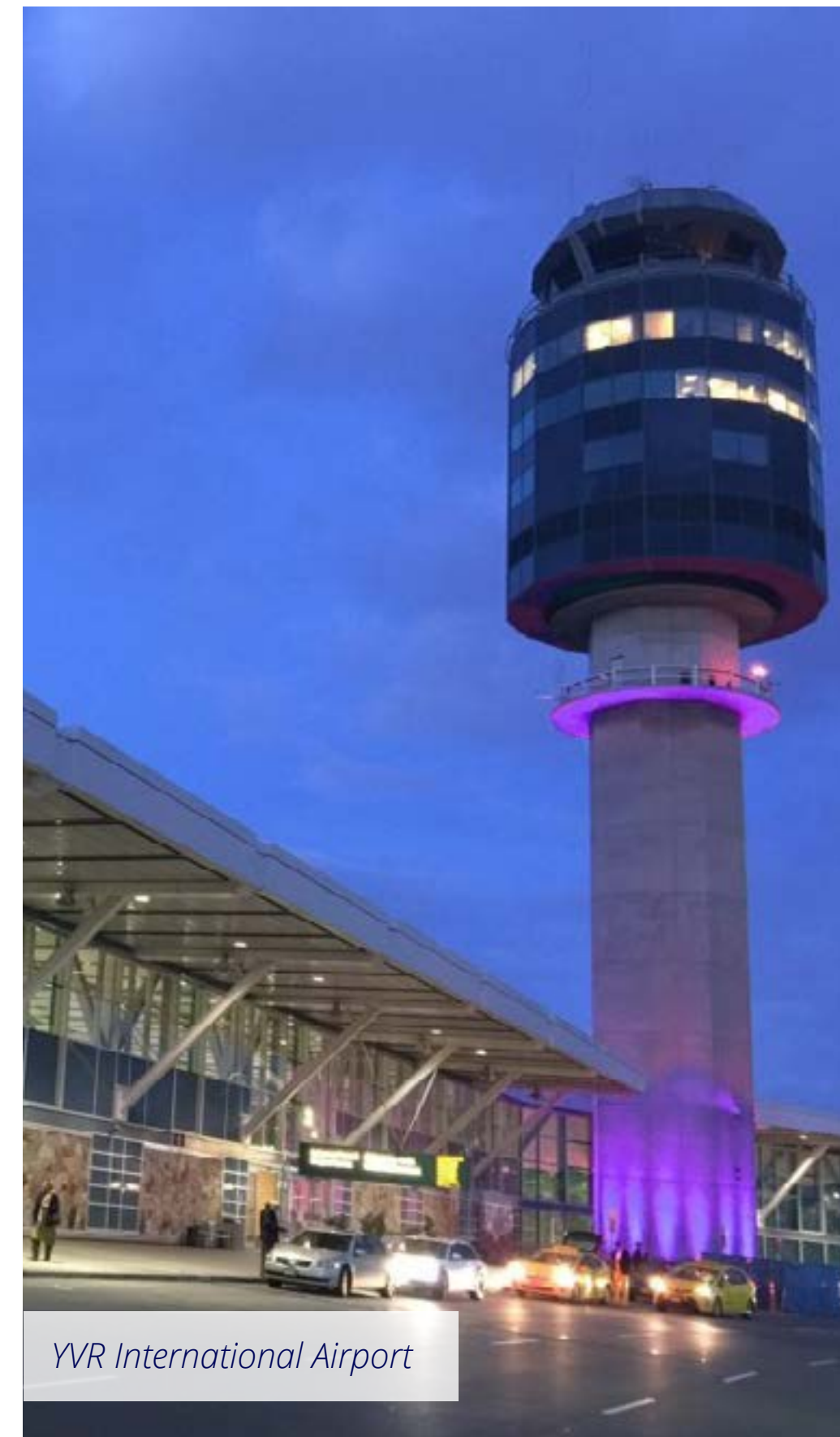
YVR International Airport