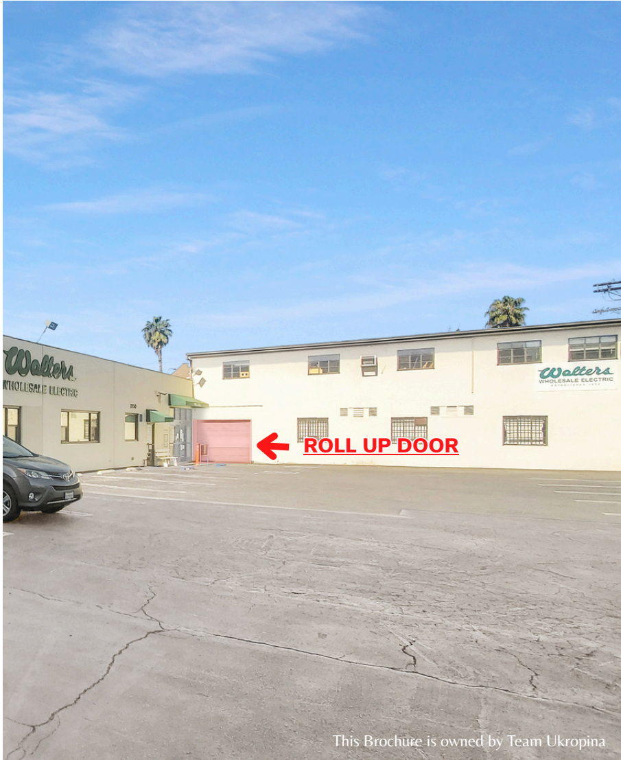
This Brochure is owned by Team Ukropina