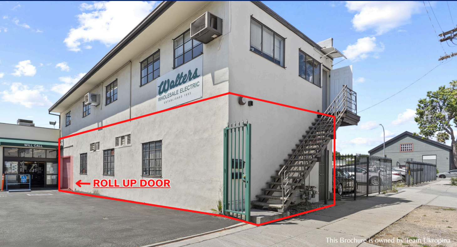
This Brochure is owned by Team Ukropina

GROUND FLOOR SPACE WITH ROLL UP DOOR AVAILABLE