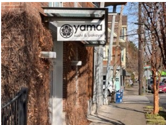
Shops & Restaurants along SE 21 st Avenue