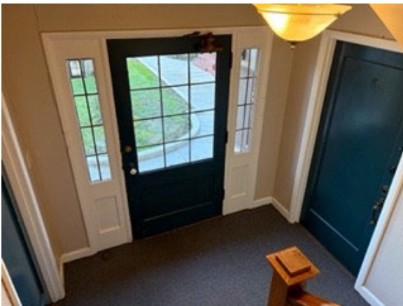
Vintage Foyer with Period Detail