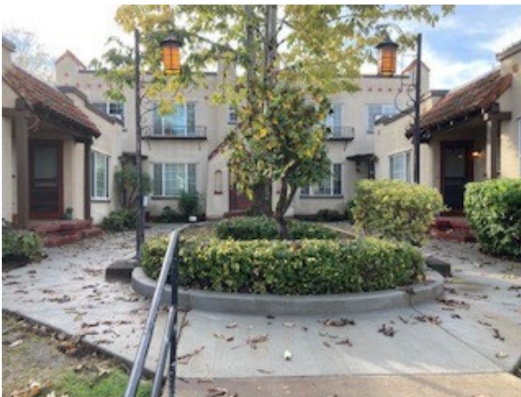
Classic Mediterranean Inspired Courtyard