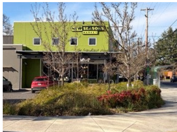
Seven Corners New Seasons Supermarket