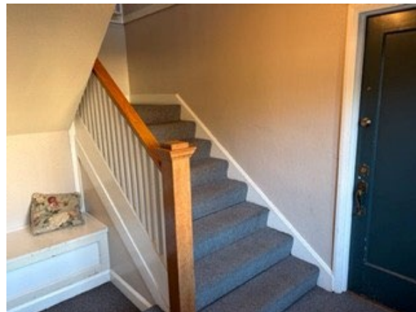
Well Maintained Entryway with Seating Area