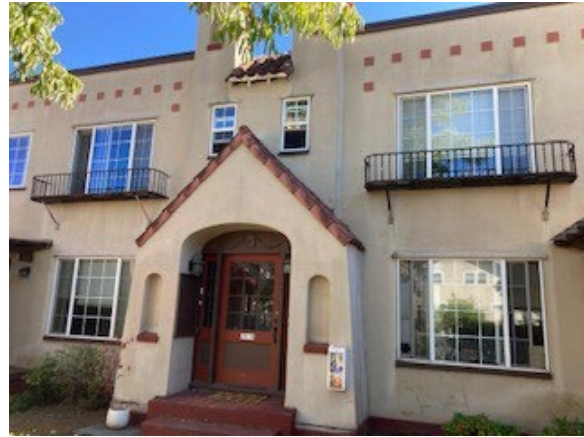
Mediterranean Architectural Features