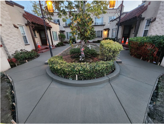
New Concrete Courtyard Walkway 2025