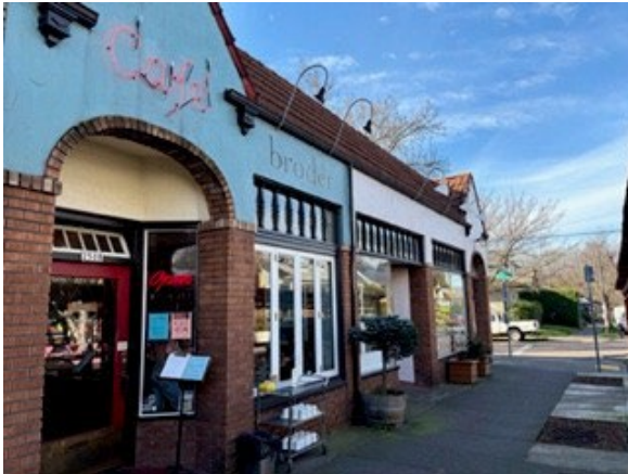
Broder Café on SE Clinton Street