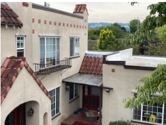
Excellent Location Minutes from Downtown