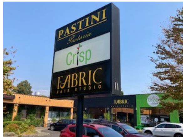
Restaurants & Retail Stores on SE Division