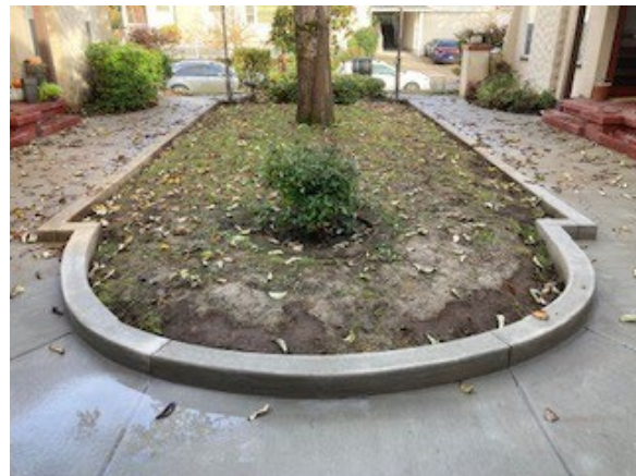
Courtyard Features All New Concrete