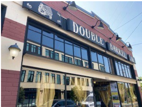
Double Barrel Brew Pub on SE Division