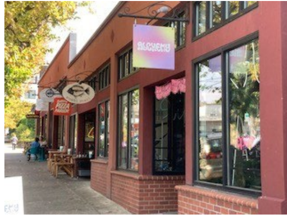
Shops & Restaurants along SE Division Street