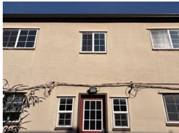
Newer Vinyl Windows