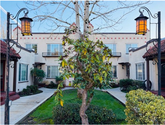
Pride of Ownership Building in Heart of SE