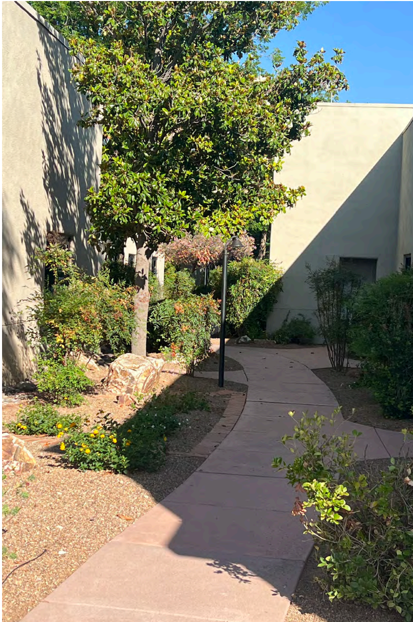
Rear of Building - Path to Common Restrooms