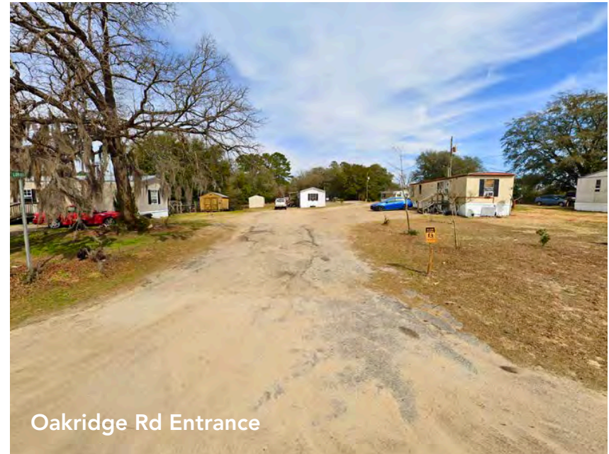
Oakridge Rd Entrance