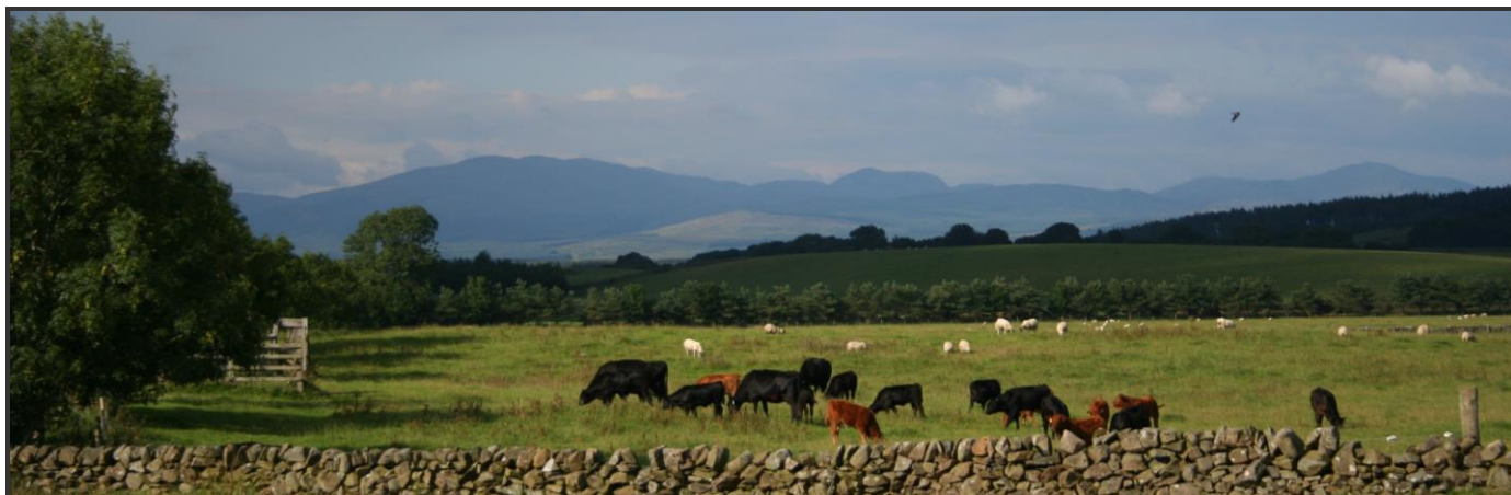
View from Plots

Small building development situated on the outskirts of the rural village of Kirkcowan within 1 mile of the A75 Euro route. The plots have Outline Planning Permission for four dwellings and are offered for sale as a whole or in four separate lots. Kirkcowan is a small rural village with amenities including village shop and post office, doctor's surgery, primary school and bowling green.