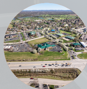
HIGH VISIBILITY LOCATION