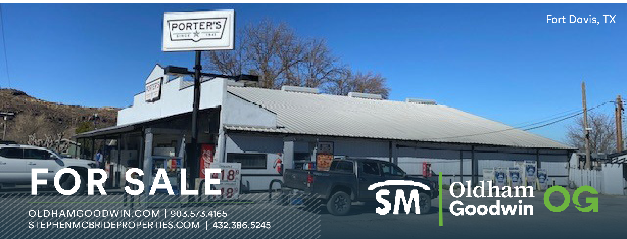
Fort Davis, TX