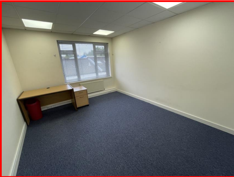
Example office Suite

Bridge Road Innovation Centre offers individuals and small companies budget rental options, within a smart and functional office environment, and conveniently located to local shops, bus routes and quick access to J4 of the M3.