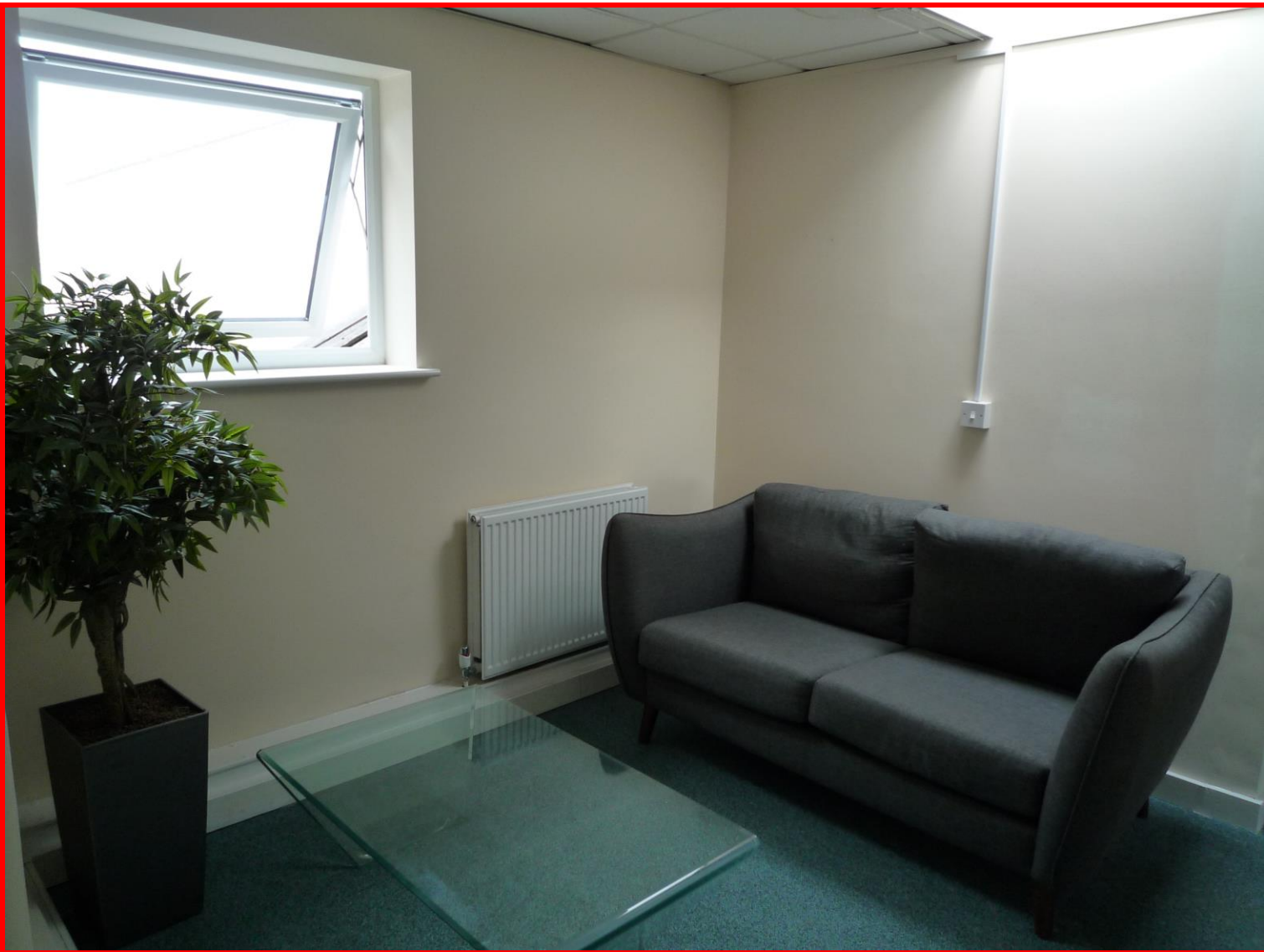
Above showing break out area