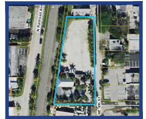
AERIAL PHOTOGRAPH (NOT-TO-SCALE)

LEGEND: (A)=SET 5/8" IRON ROD AND CAP "LB 8642"