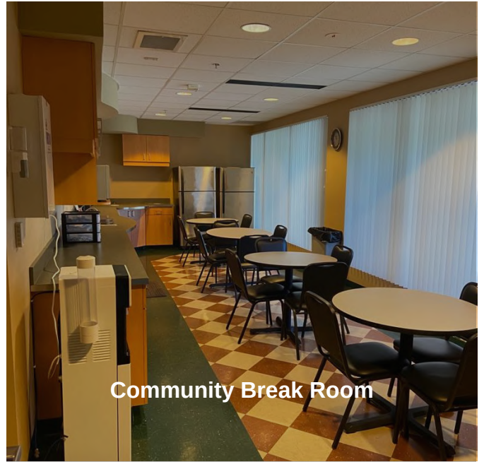
Community Break Room