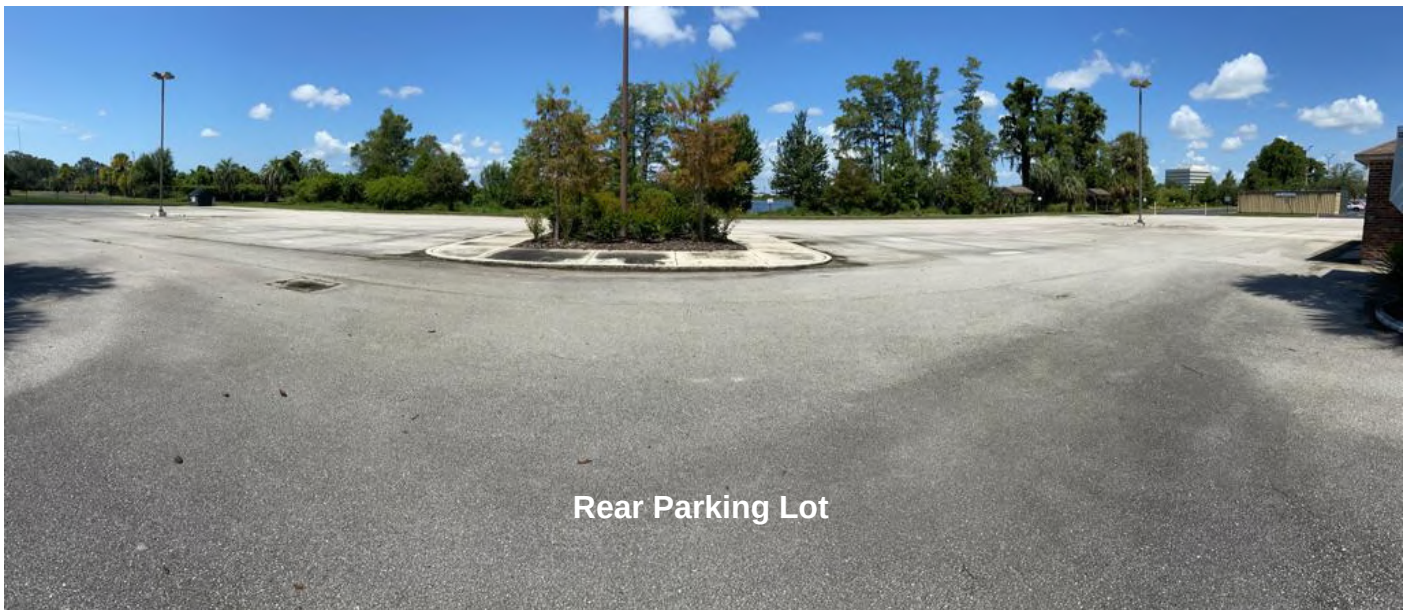
Rear Parking Lot

This information has been obtained from sources believed reliable, but has not been verified for accuracy or completeness. You should conduct a careful, independent investigation of the property and verify all information. Any reliance on this information is solely at your own risk. Allied Commercial and the Allied Commercial logo are service marks of Allied Commercial Partners, LLC. All other marks displayed on this document are the property of their respective owners. Photos herein are the property of their respective owners. Use of these images without the express written consent of the owner is prohibited.