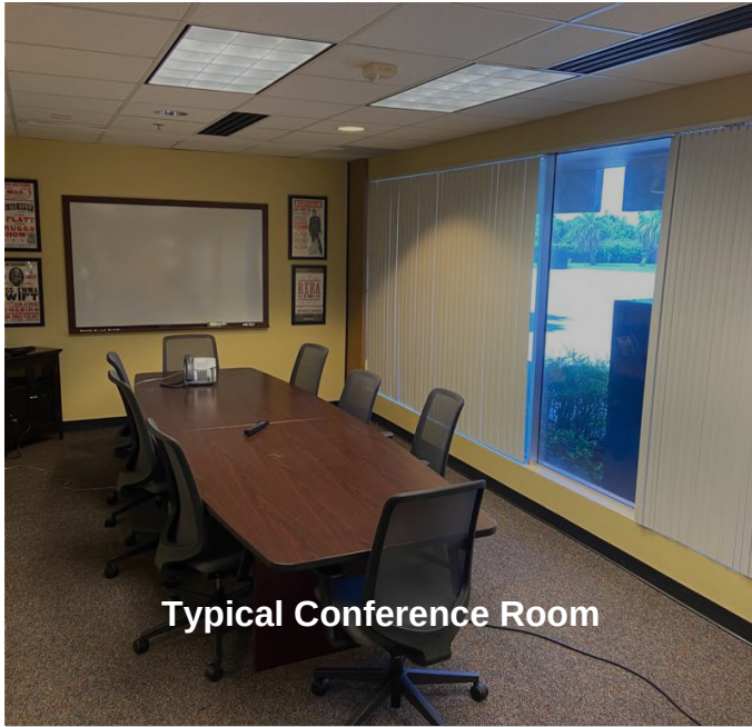
Typical Conference Room