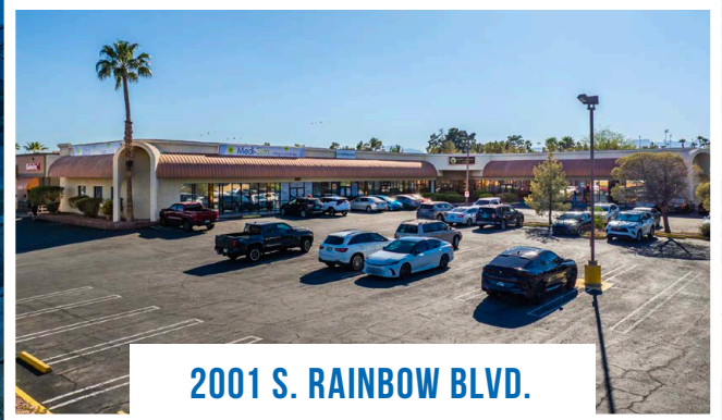
2001 S. RAINBOW BLVD.