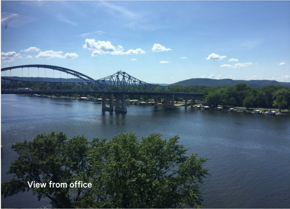
View from office