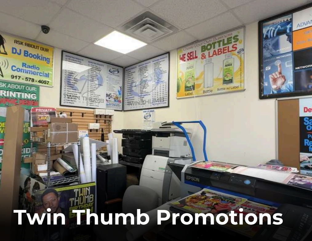
Twin Thumb Promotions