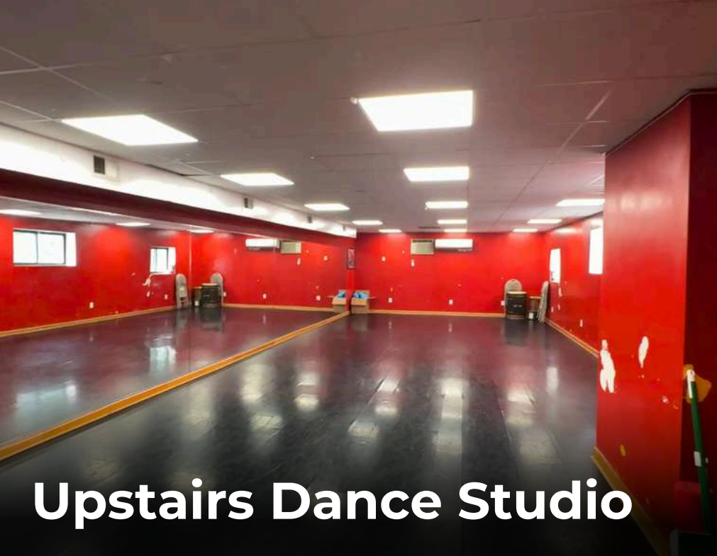
Upstairs Dance Studio