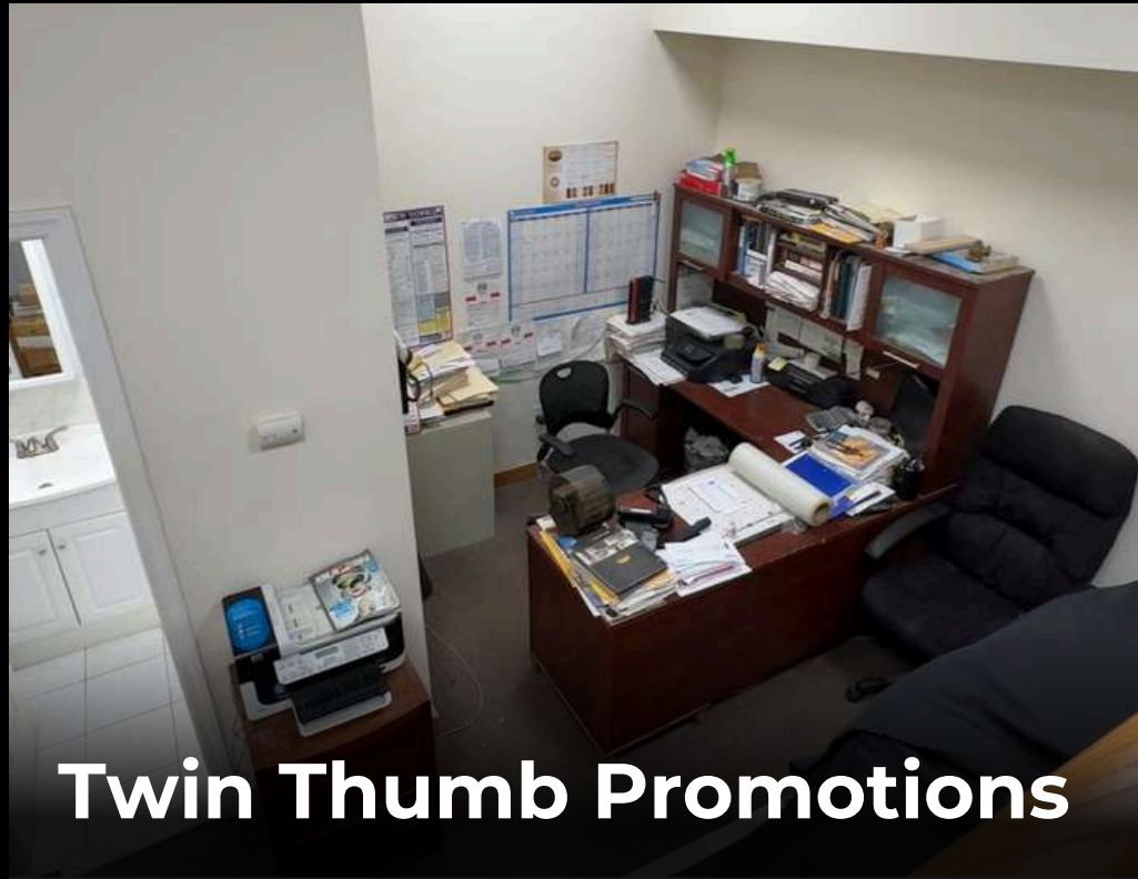
Twin Thumb Promotions