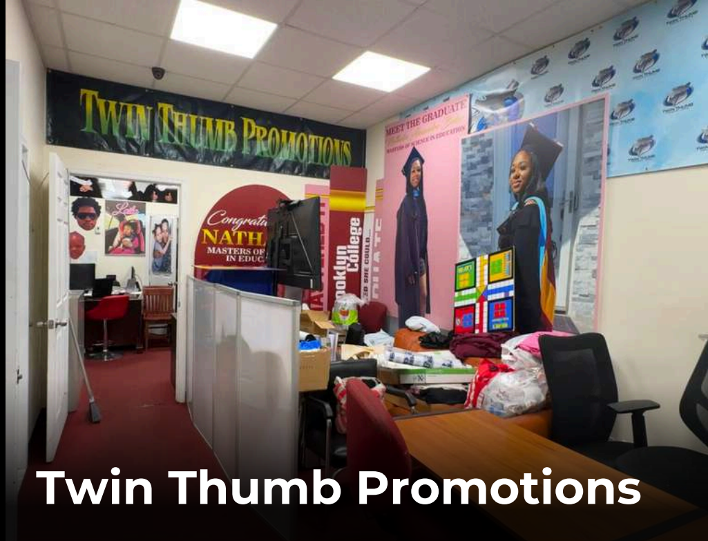
Twin Thumb Promotions