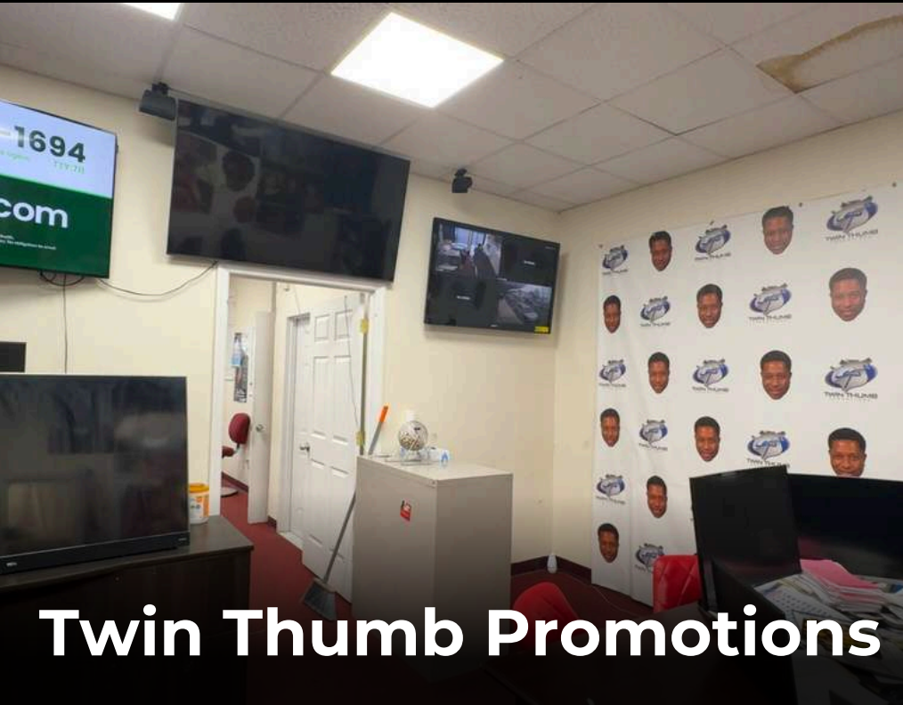
Twin Thumb Promotions