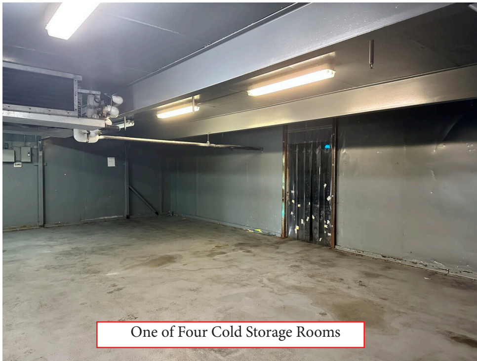
One of Four Cold Storage Rooms