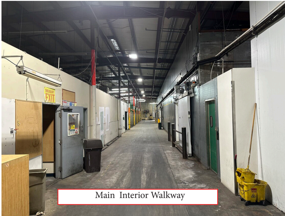
Main Interior Walkway