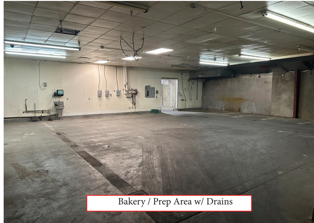
Bakery / Prep Area w/ Drains