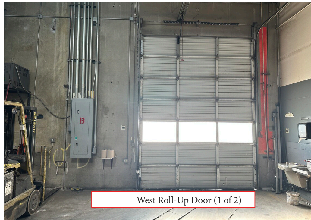
West Roll-Up Door (1 of 2)