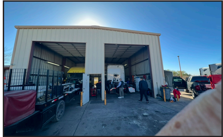
+/- 1,600 SF at rear of property