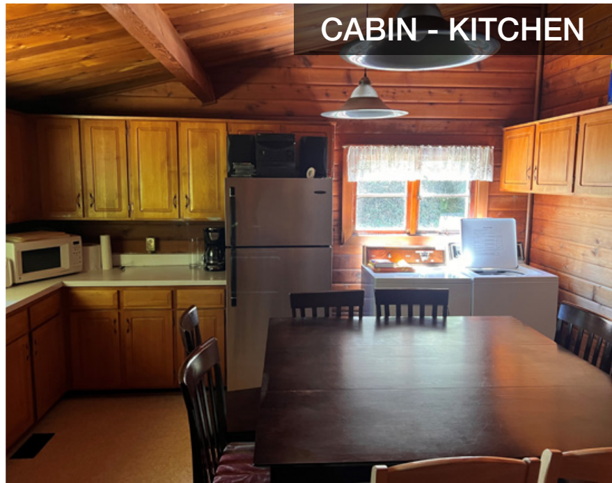
CABIN - KITCHEN