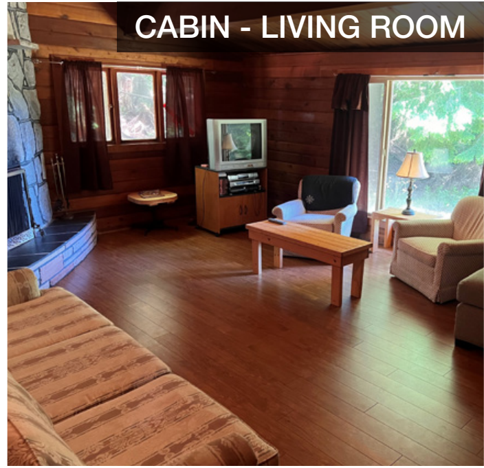
CABIN - LIVING ROOM