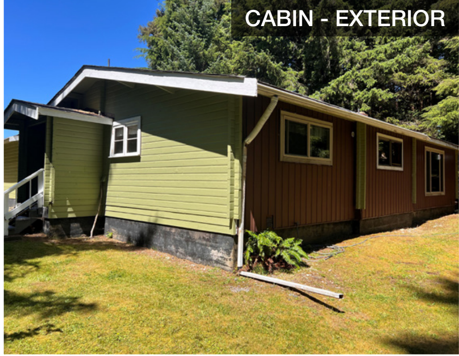
CABIN - EXTERIOR