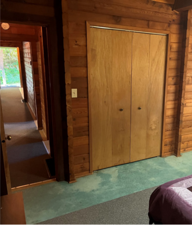
CABIN - BEDROOMS