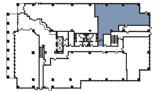
FLOOR LOCATION PLAN