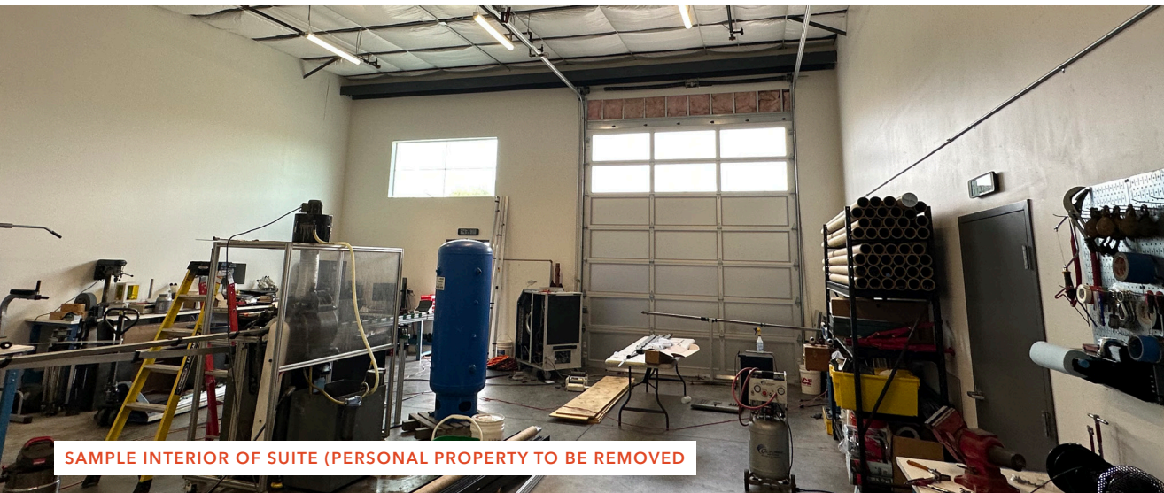
SAMPLE INTERIOR OF SUITE (PERSONAL PROPERTY TO BE REMOVED)