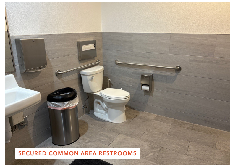
SECURED COMMON AREA RESTROOMS