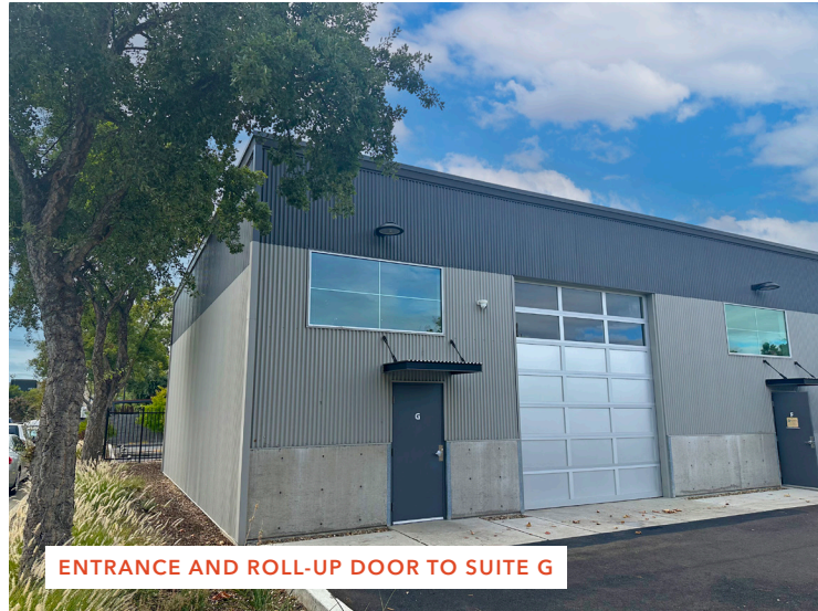
ENTRANCE AND ROLL-UP DOOR TO SUITE G