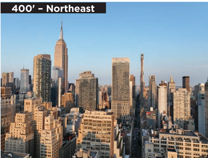
400' - Northeast