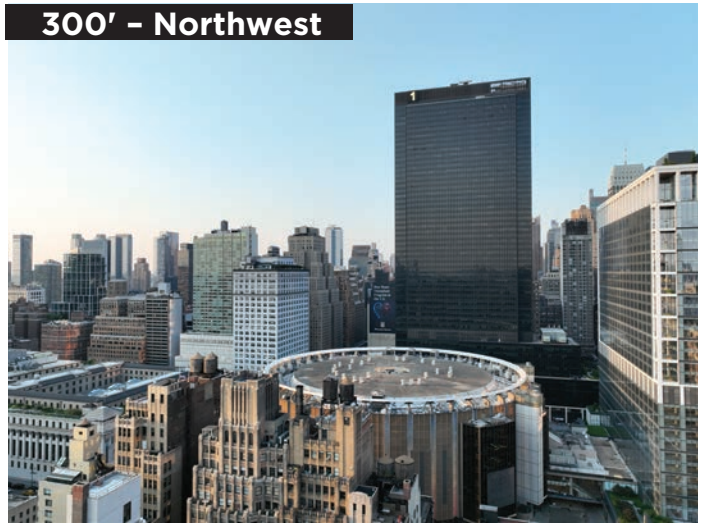
300' - Northwest