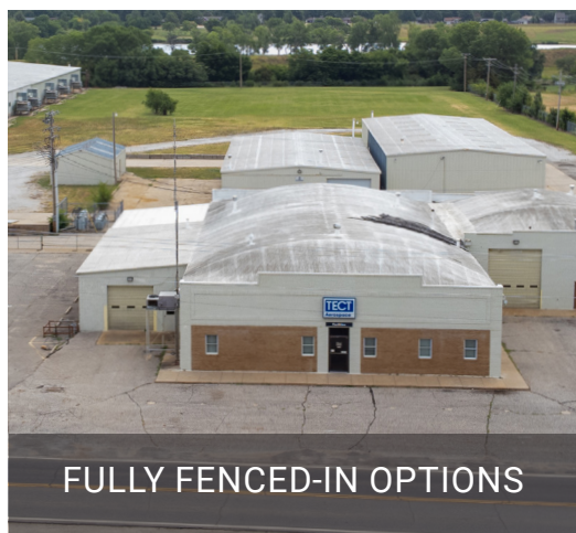
FULLY FENCED-IN OPTIONS