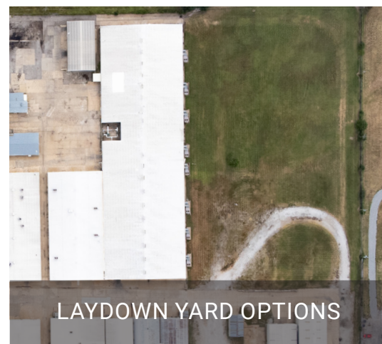
LAYDOWN YARD OPTIONS