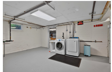
Basement Laundry Facilities