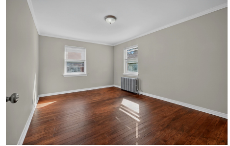
Bedroom — Natural Light