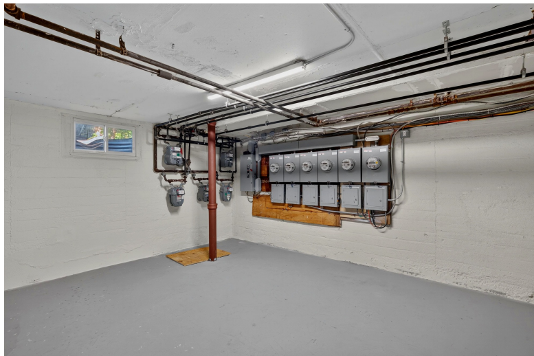
Basement Utilities — Separate Electric Meters per Unit (Tenant-Paid Electric)