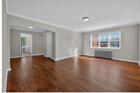
Living Room — Hardwood Floors