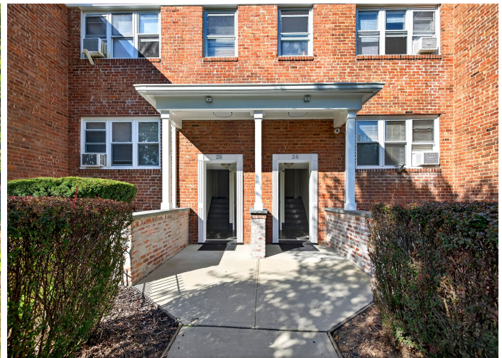
BUILDING ENTRY DETAIL