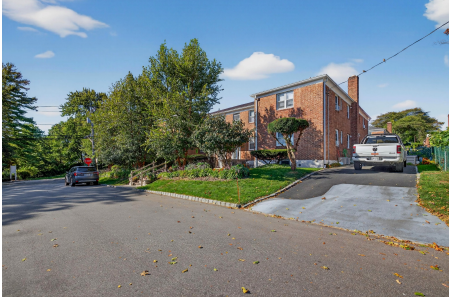
Exterior — Side View & Parking