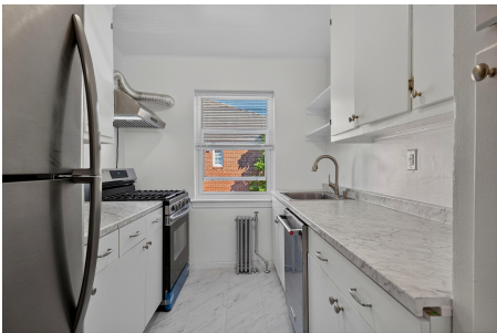
Renovated Kitchen — New Counters