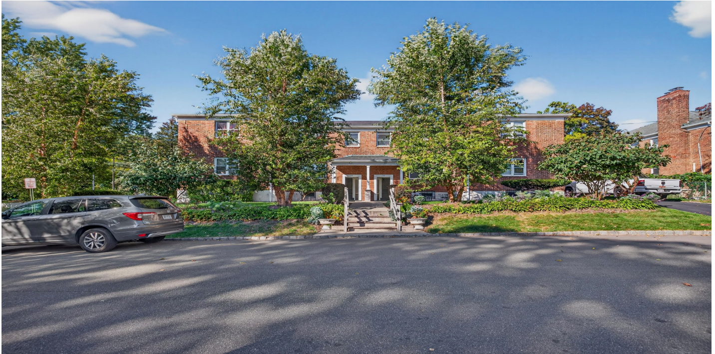
STREET VIEW — Linden Street (26 & 28 Linden St)

28 Linden Street | Great Neck (Thomaston), NY 11021