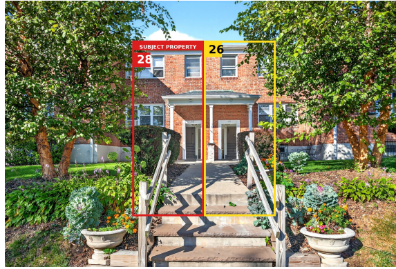
Subject Property — 28 Linden Street, Great Neck (Thomaston), NY